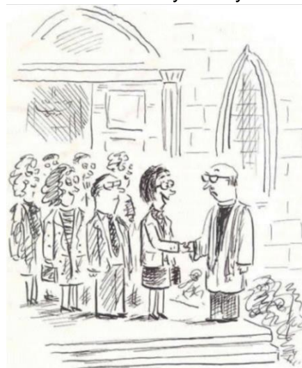
"I really liked that stuff you were saying about all of us being sinners and how we're damned for eternity."